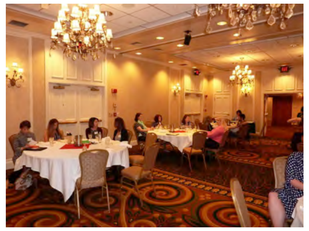
VPO's 2017 Annual Meeting and Conference - Lunch