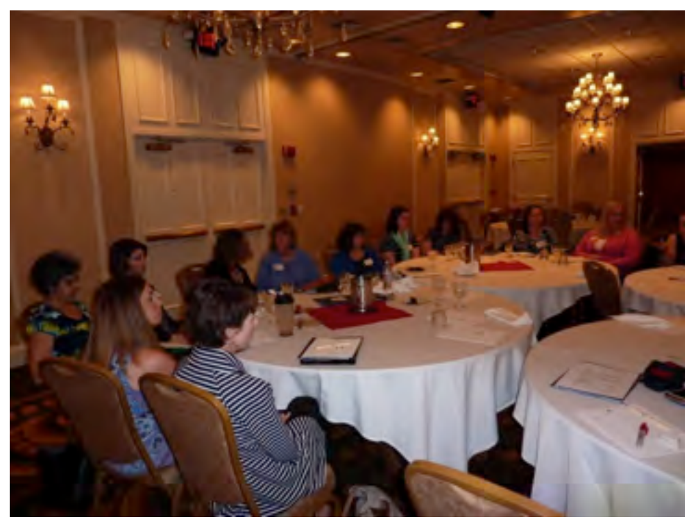
VPO's 2017 Annual Meeting and Conference - Roundtable Discussion